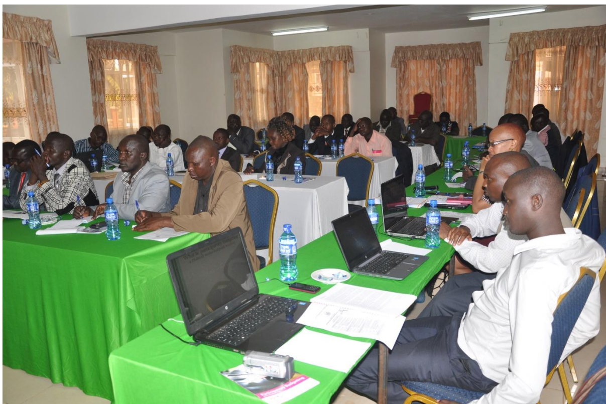
Picture 1: Training of MCAs, Ward Administrators and Sub County Administrators on Participatory Budgeting