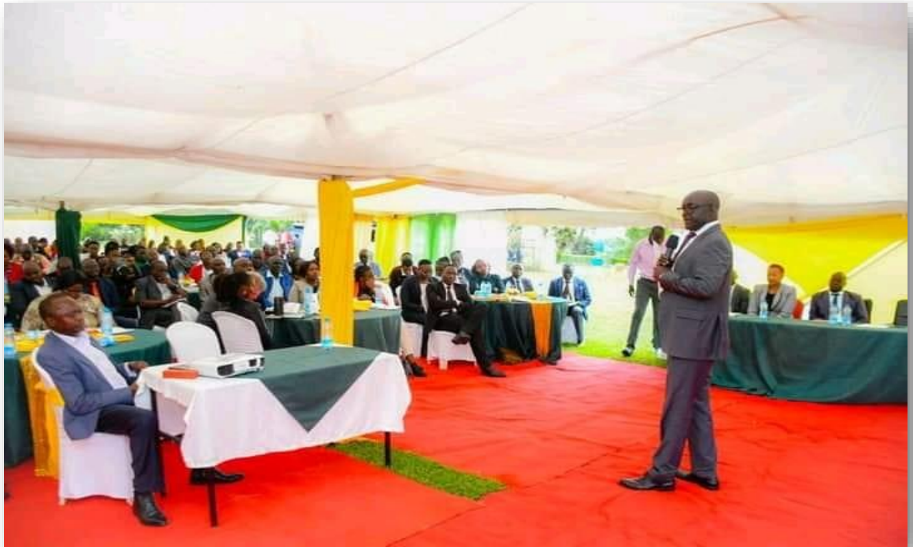
Figure 7: H.E. The Governor, West Pokot County, Simon Kachapin Addressing development partners at Governors Residence