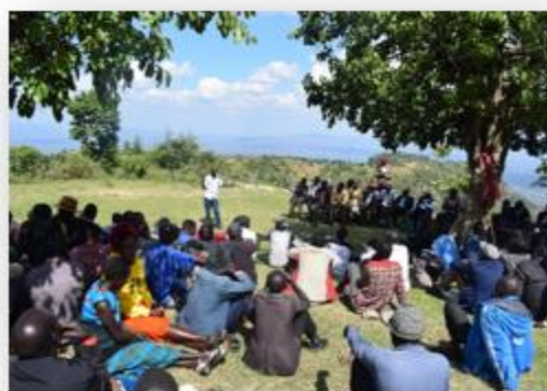
Figure 9 Community dialogue and Kalya Hotel and Lomut ward