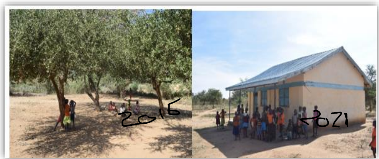
Figure 3: construction of ECDE Classroom from under a tree

West Pokot County in addressing SDG 4 on education, increased establishment of EDCE centres from 479 centres to 1,185 ECDE centres this increased ECDE enrolment from 33,398 in 2016 to 76,275 ECDE learners in 2024 which represent 128.38 percent increase.