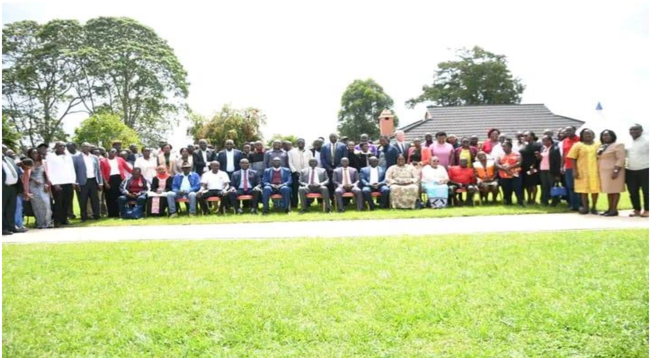
Figure 6: Development partners engagement forum with County Government of west Pokot, where 65 key partners participated

West Pokot County have Inter-Agency Committee known as Technical Working Group (TWG) which is coordinated by and County Inter- Governmental Forum Chaired by H.E the Governor.