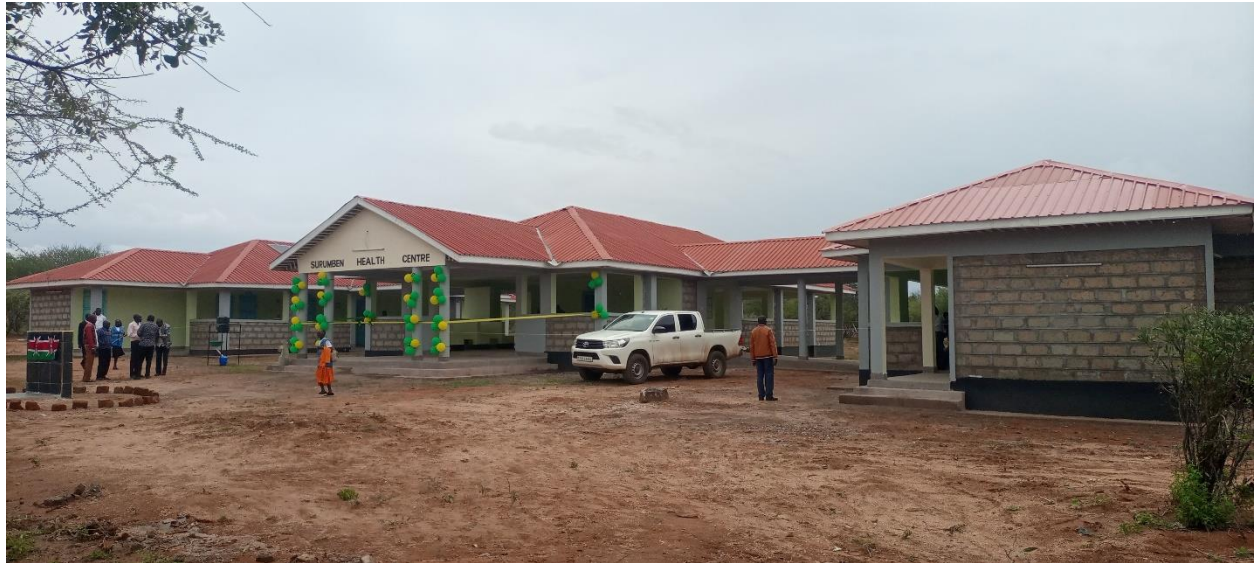
Figure 1: Health Centre for Masol Integrated officially opened and operational