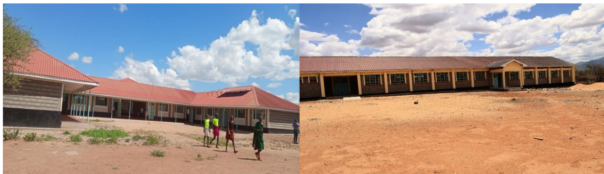
Figure 2: Masol primary school under integrated project (SRUMBEN PRIMARY)