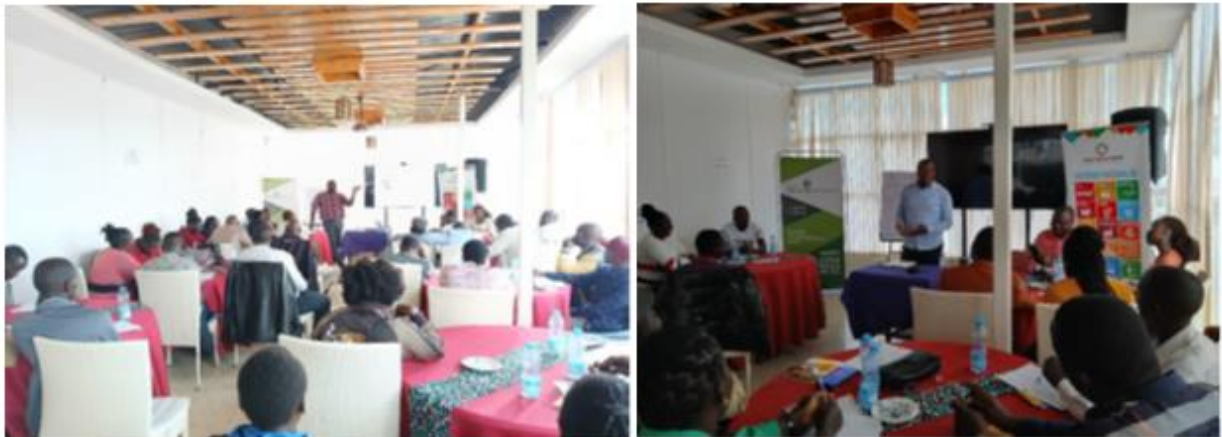
Figure 3: Facilitator and Executive Director CMD taking participants through SDG priorities/

A multistakeholder dialogue convened by fifty-seven (57) participants, including representatives from political parties, CSOs, the private sector, academia, media, of which twenty county government, seven executives which established Local Steering Group to strengthen SDG implementations and dialogues at devolved levels. champion was the Co-Chair of the committee.