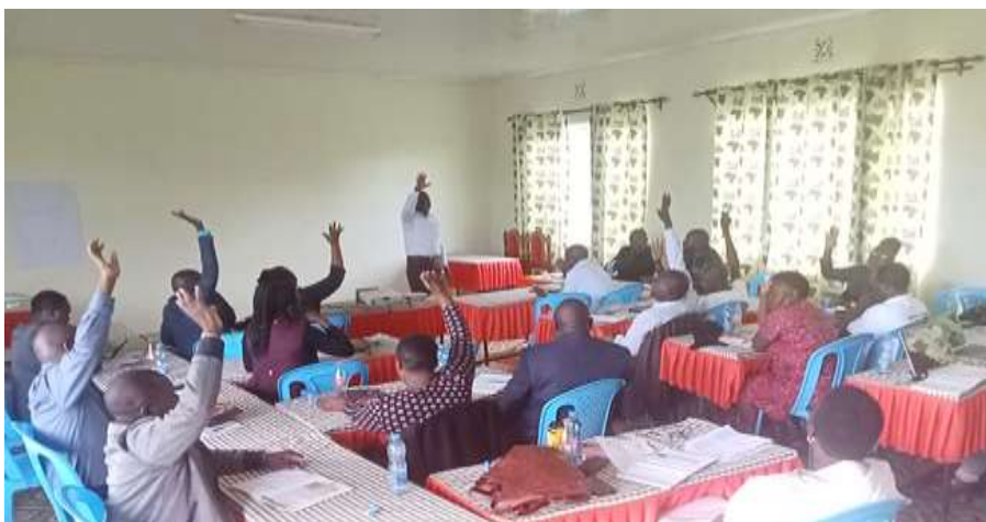
Figure 8: CASSCOM members voting by acclamation to approve Boresha Mazingira project and KABDP Work plan and Budget