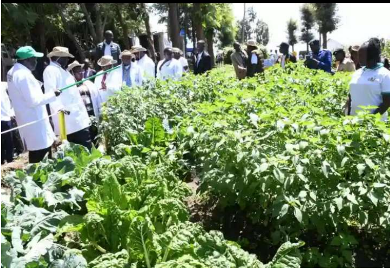
Figure 2: H.E The Governor Hon. Simon Kachapin, CECMs, CO, Directors and other guests during agriculture trade fair show and exhibition