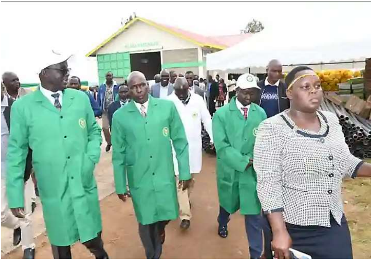
Launching of kilimo house store & veterinary cold chain room, livestock drags/vaccines/acaricides, spray pumps