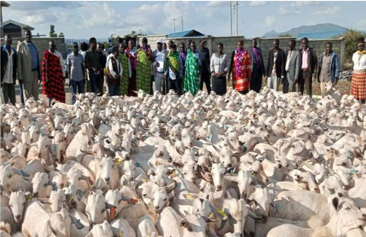
Figure 1 launch of distribution of 1401 galla goats by H.E the governor of West Pokot County, Simon Kachapin on 6/7/2023