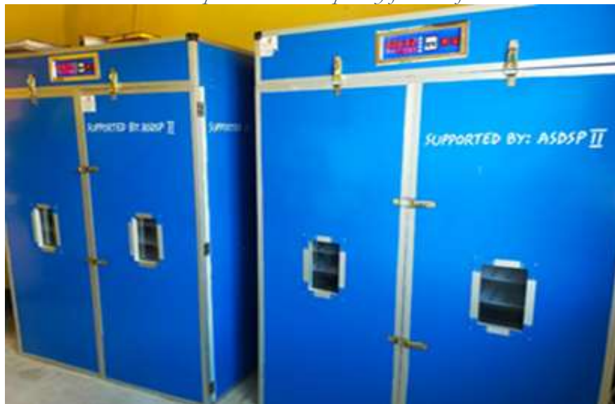
The two, 2,000 capacity egg incubators provided to ARAKUKO supported by ASDSP II West Pokot County.

In the honey VC, the programme supported 10 groups with 120 modern bee hives, 5 centrifugal honey extractors, 5 honey weighing scales 10 sets of honey harvesting gear including the bee brushes and the smokers. It also provided 1000 packaging bottles and 25