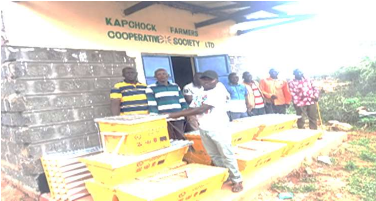
Figure 6: Kapchok Farmers' Cooperative Society Ltd receiving assorted beehives for apiary set up

food grade honey filtering buckets in order to promote value addition of honey. A total of 200 group members benefitted from the support.