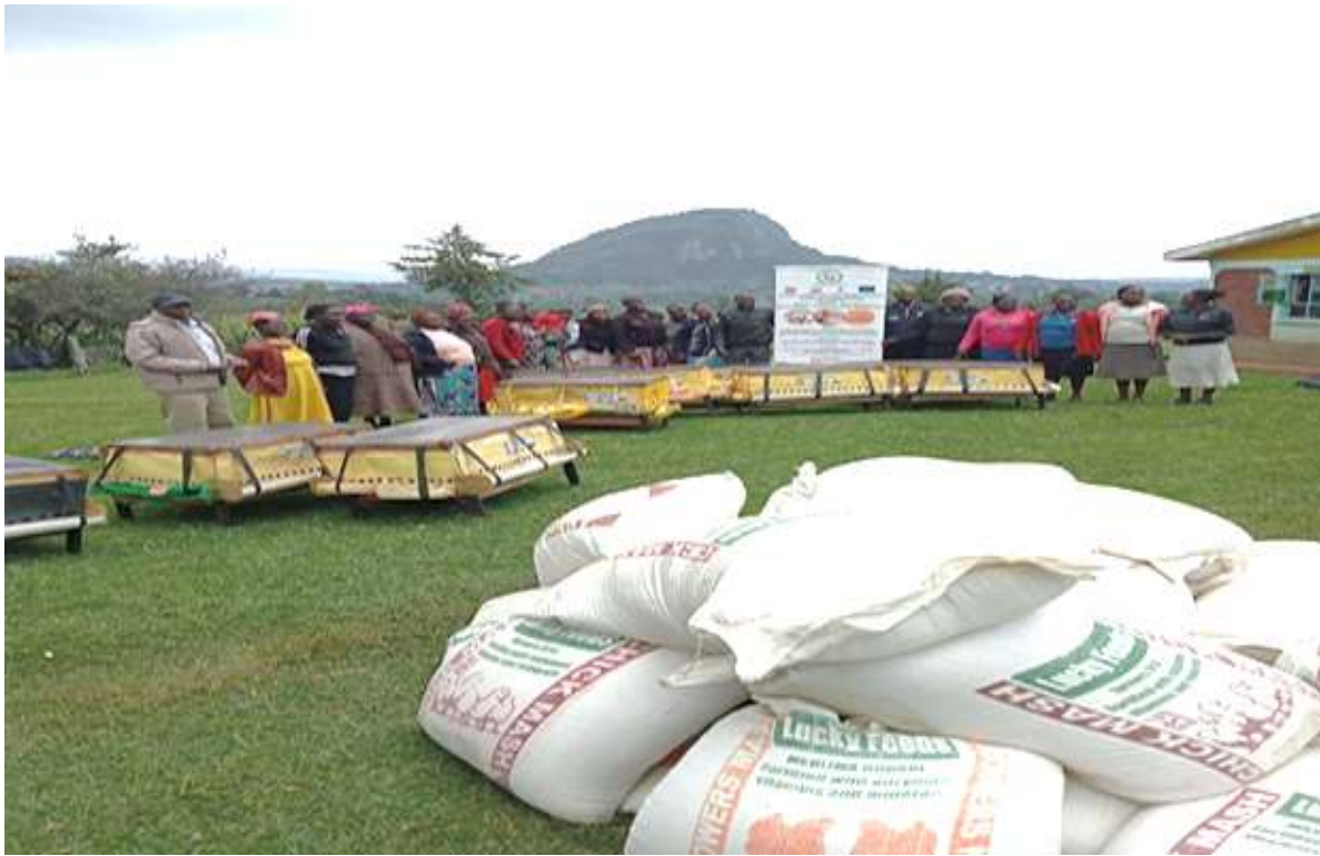
Tamkai Women Group receive assorted poultry feed and fireless brooders