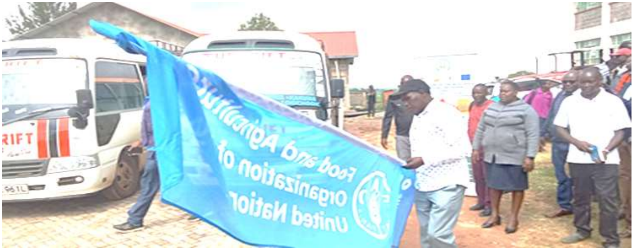
The CECM Agriculture flanked by the CO, CPC ASDSP II and FAO West Pokot Representative flagging off a group of VCAs on a learning tour jointly supported by FAO and ASDSP II

The Programme supported value chain innovations with high prospects for women and youth economic empowerment. A snapshot of innovation support is as indicated below: