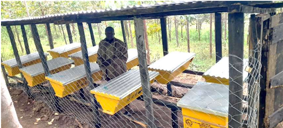
Apiary set by Greenpto SHG in Pokot Central Sub-County, Lomut ward.

The programme also supported the establishment of 10 apiary demonstration sites with 100 assorted modern bee hives as evidenced in the picture below: