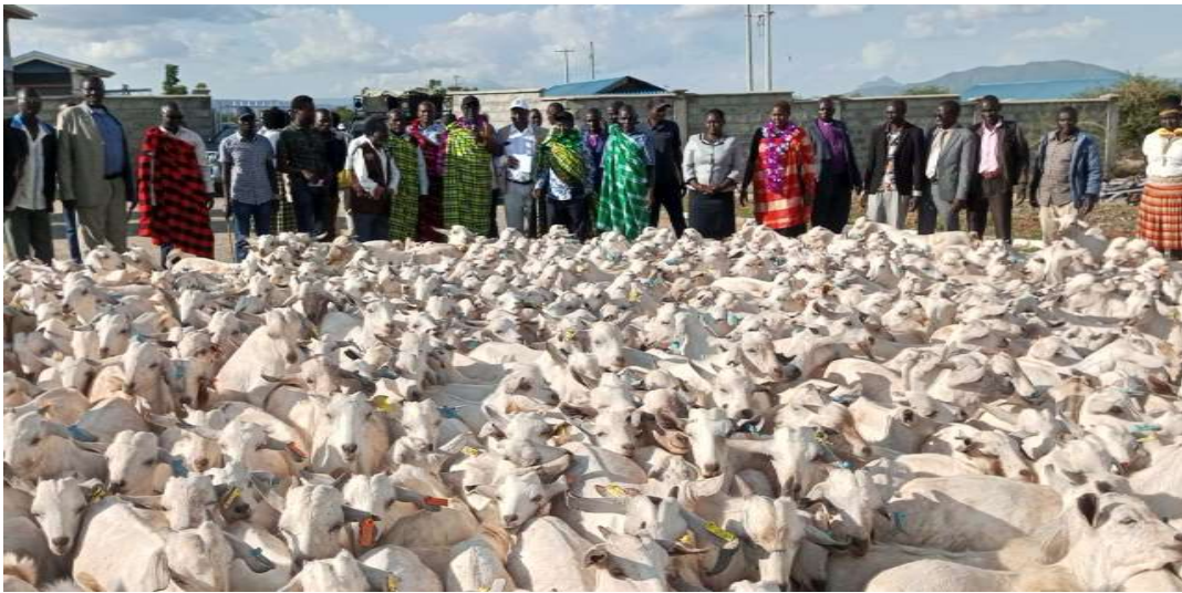
Launch of distribution of 1401 Galla goats by H.E the governor of West Pokot County, Simon Kachapin on 6/7/2023