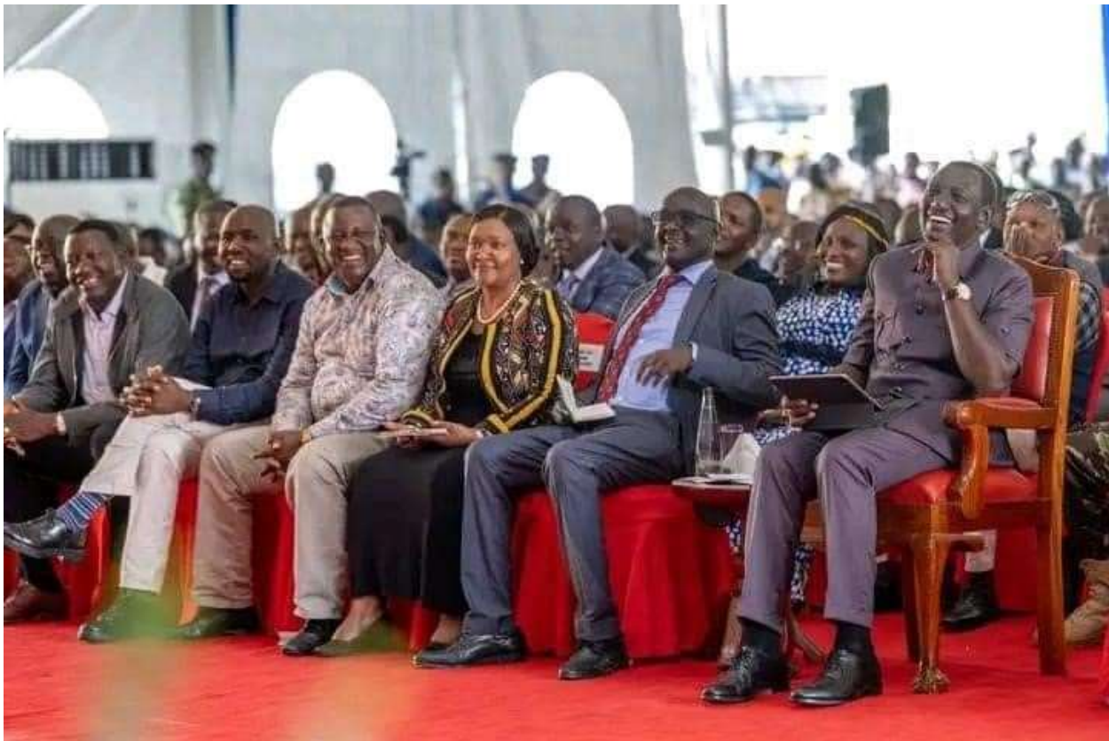
Figure 1 Official opening of Sebit cement factory

The County Executive is mandated to provide overall County leadership in the implementation of County economic and social policies by ensuring the Government works in harmony through improved policy direction, coordination, and information sharing among the County Government Departments and Agencies. The Public Service Management is mandated to coordinate effective county administration and provision of quality public services, effective and efficient management of human resources, County records management services, legal services and public Communication. Also mandated to provide leadership, coordination and policy direction on early warning system, disaster preparedness and communication, early response and livelihood recovery for sustainable development. The other directorates support in cash crop development, dairy development, resource mobilization, attracting foreign and domestic investment and promoting peace building and harmonious coexistence among various communities within and outside the county.