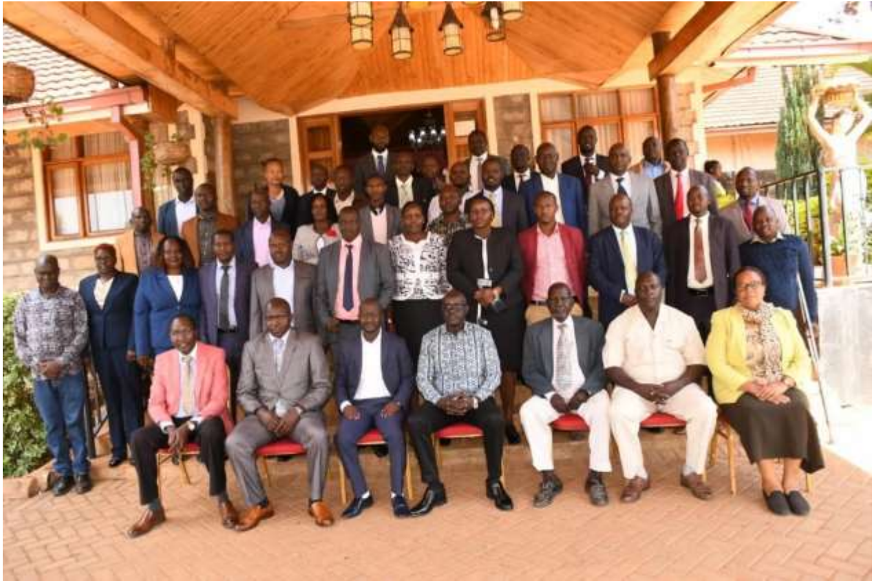
Figure 2 CBEF Forum Consultation on County Fiscal strategy paper,2024