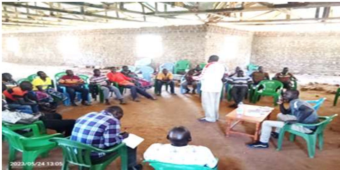
Figure 7: The County Cooperative Commissioner, Supporting the Aggregation of VCAs in Kodich Ward.

The Programme aimed at improving access to market information by VCAs through the following activities: