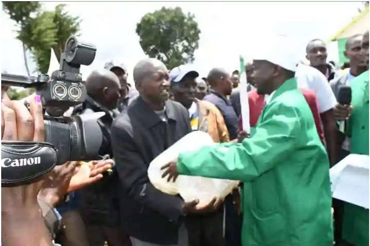
Figure 3 H.E Deputy Governor Hon.Robert Komole launching tilapia fingerlings and other farm accessories to farmers