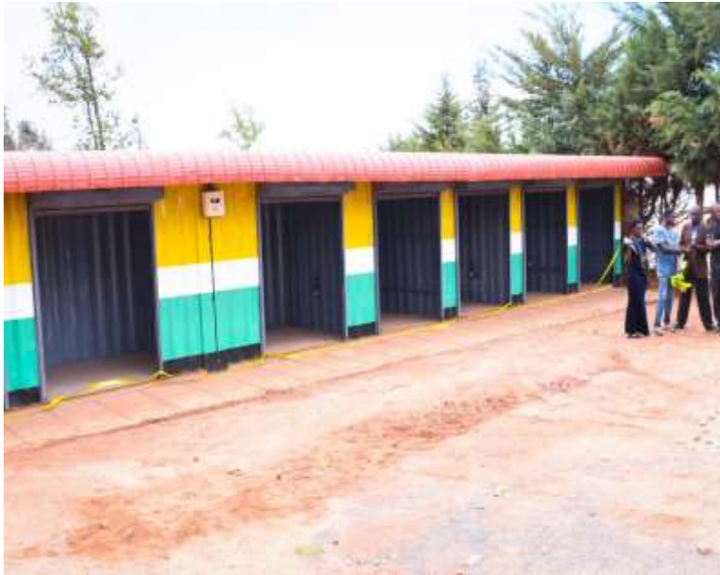
Figure 9 market stalls at Makutano during the official opening by the Governor