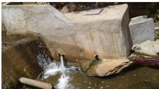
Orwa Irrigation Intake (left) and Kaminia Irrigation Civil works in progress