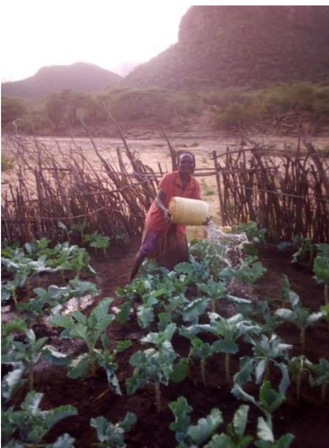
Products of extension Service as implemented by the Department of Agriculture and Irrigation in Ortum and Korokou respectively.