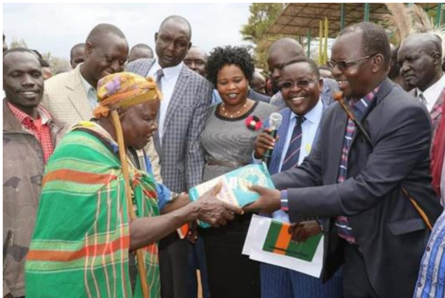
His Excellency during the launch of free seed distribution at Makutano Stadium

The above exercise is ongoing in most parts of the County. Some of the areas where ploughing has already occurred include: Weiwei farmers irrigation scheme, Sekker, Konyao and Korokou, The cumulative acreage is bound to increase tremendously as we approach the onset of rain. Despite the growing acreage being plowed, the level of revenue generated does not match the operational cost incurred. This is due the fact that the exercise is almost entirely “service provision” as opposed to commercial land preparation. This is evident in Weiwei Farmers irrigation scheme and Takaywa farming community where the County executive expressed a desire to do the plowing at the cost of the county government to enable the struggling farmers bounce back in its operations and increase food security in the predominantly pastoral area in Kases, Kowuur and Ombolion.