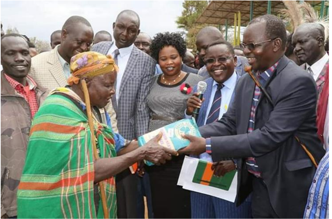
His Excellency during the launch of free seed distribution at Makutano Stadium