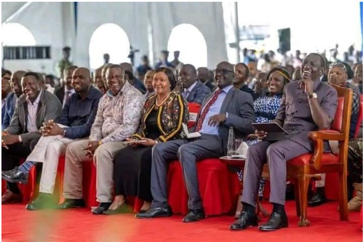
Figure 1 Official opening of Sebit cement factory

The County Executive is mandated to provide overall County leadership in the implementation of County economic and social policies by ensuring the Government works in harmony through improved policy direction, coordination, and information sharing among the County Government Departments and Agencies. The Public Service Management is mandated to coordinate effective county administration and provision of quality public services, effective and efficient management of human resources, County records management services, legal services and public Communication. Also mandated to provide leadership, coordination and policy direction on early warning system, disaster preparedness and communication, early response and livelihood recovery for sustainable development. The other directorates support in cash crop development, dairy development, resource mobilization, attracting foreign and domestic investment and promoting peace building and harmonious coexistence among various communities within and outside the county.