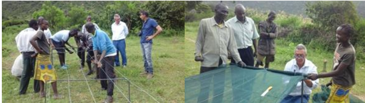
Figure 1: Sema Kenya Project demonstration on how to set up a tomato drying bed.