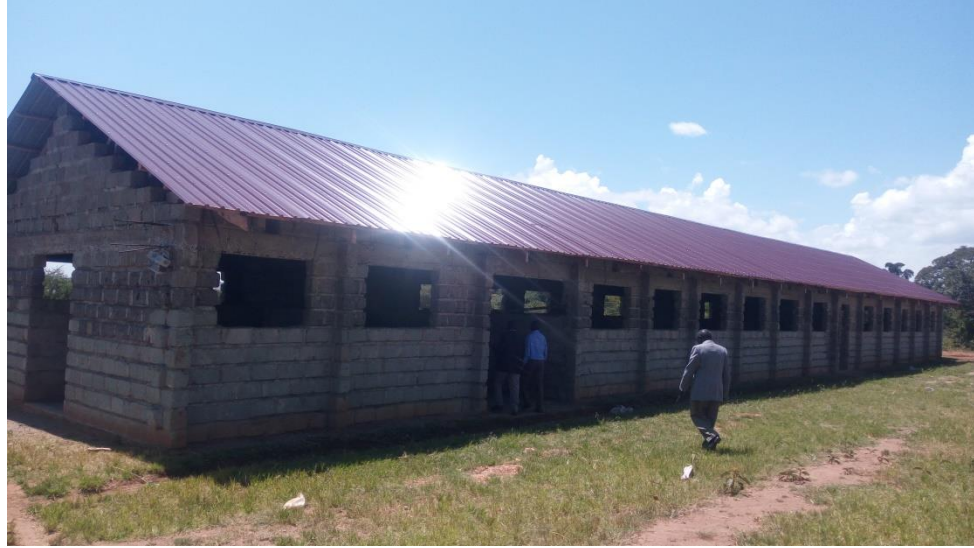
Figure 8: Katikomor roofed dormitory