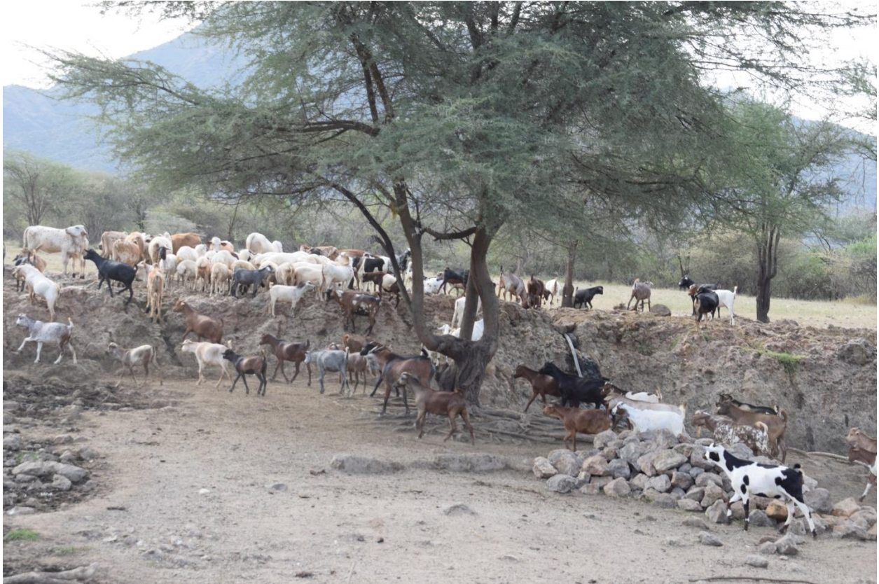
Figure 15:goats drinking water from spring near the school.