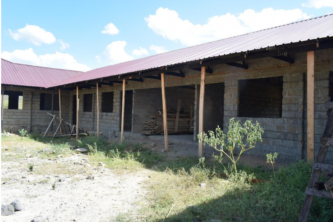
Figure 12: Akulo classroom block