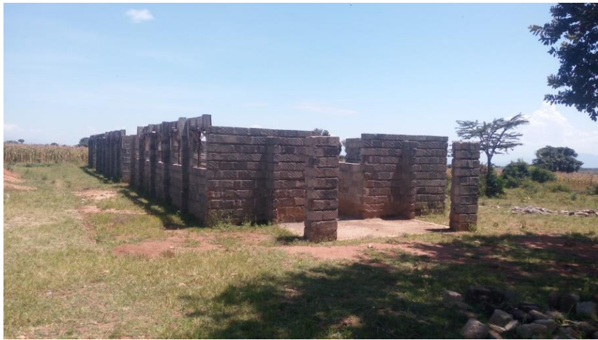
Figure 9: Katikomor dormitory at walling level