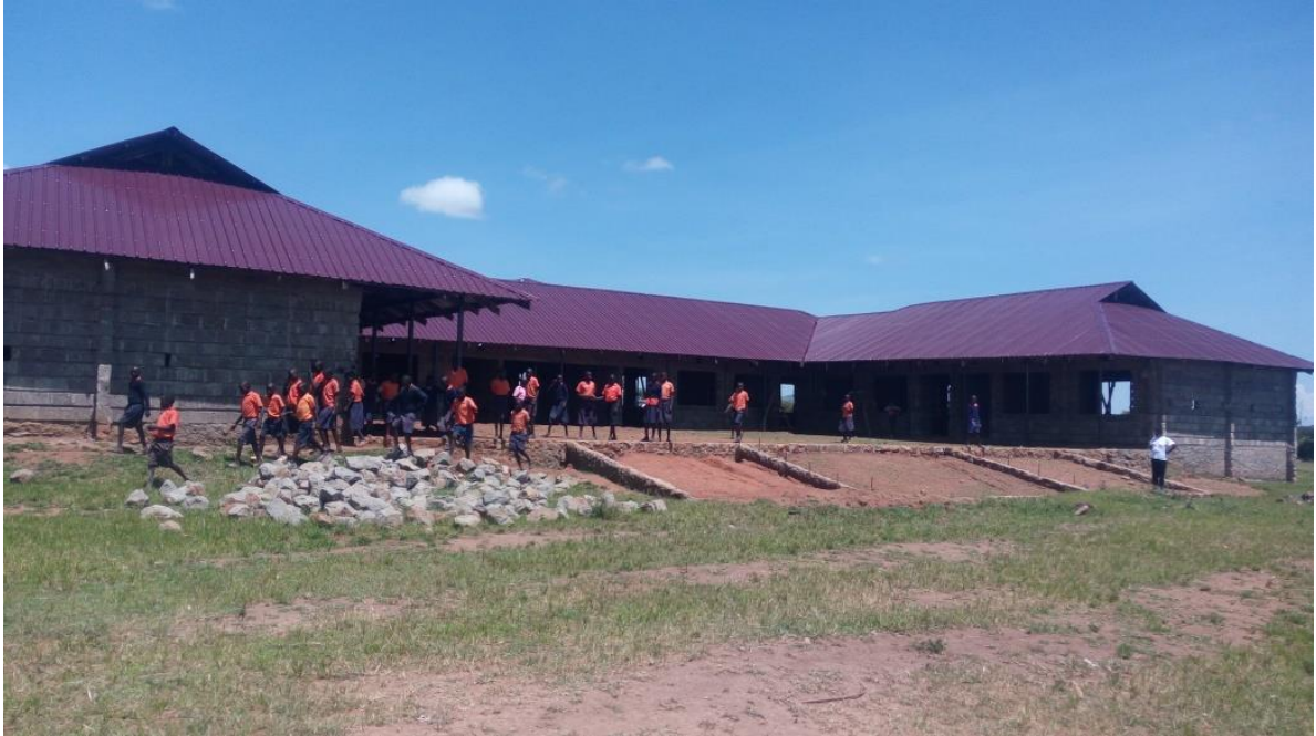
Figure 7: Katikomor class room block