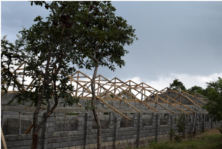
Figure 4: Kanyerus dormitory-roofing stage