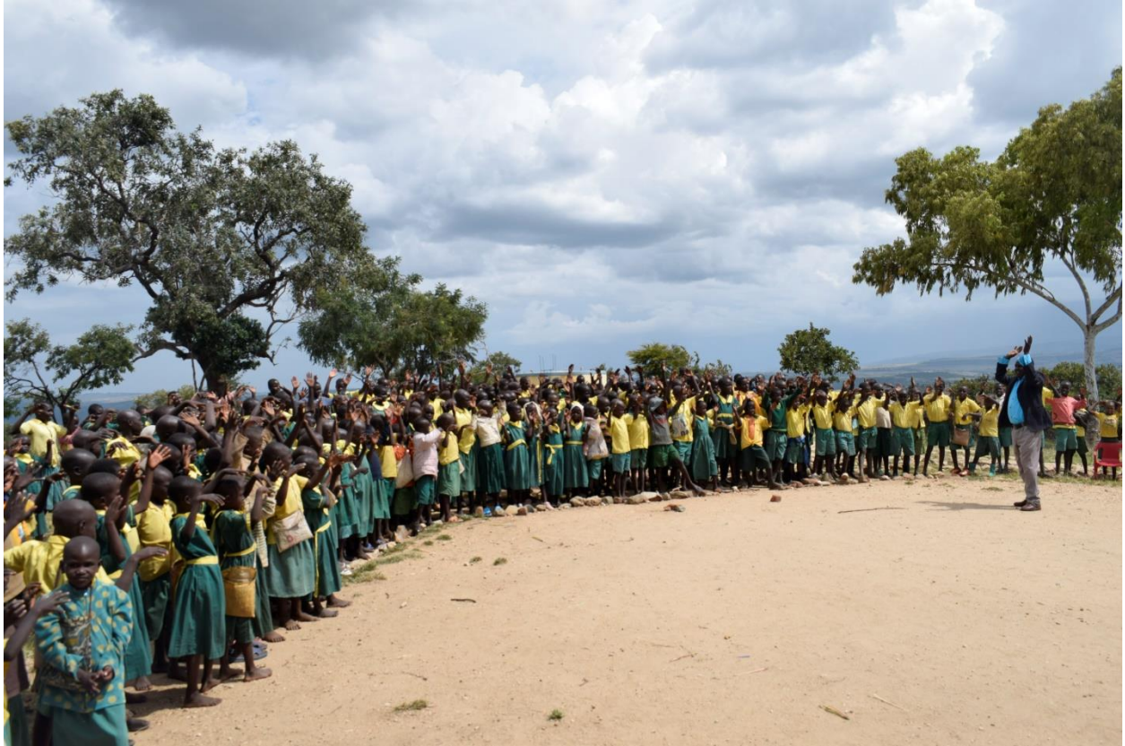
Figure 5: Kanyerus pupils from west Pokot