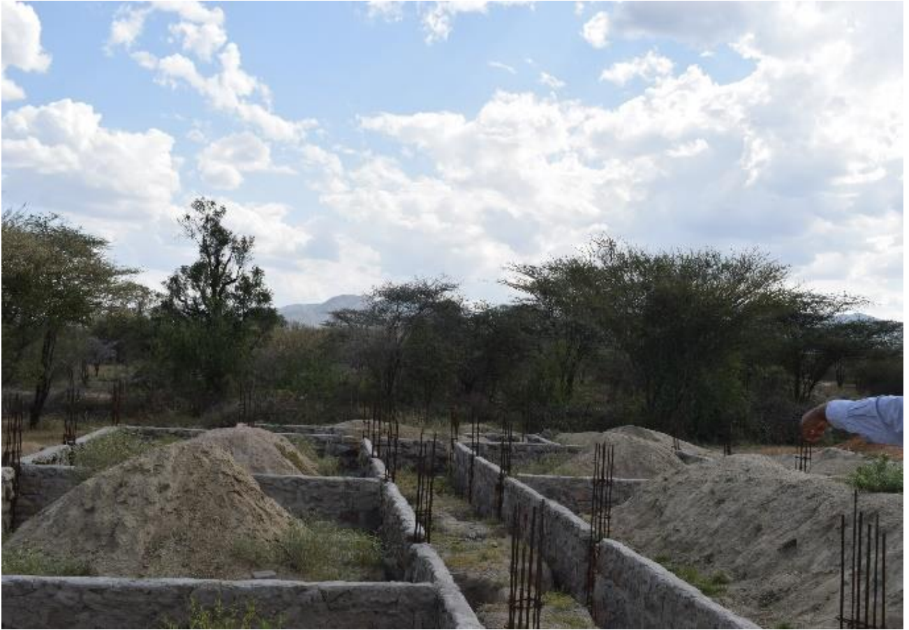
Figure 14administration block at Akulo peace school