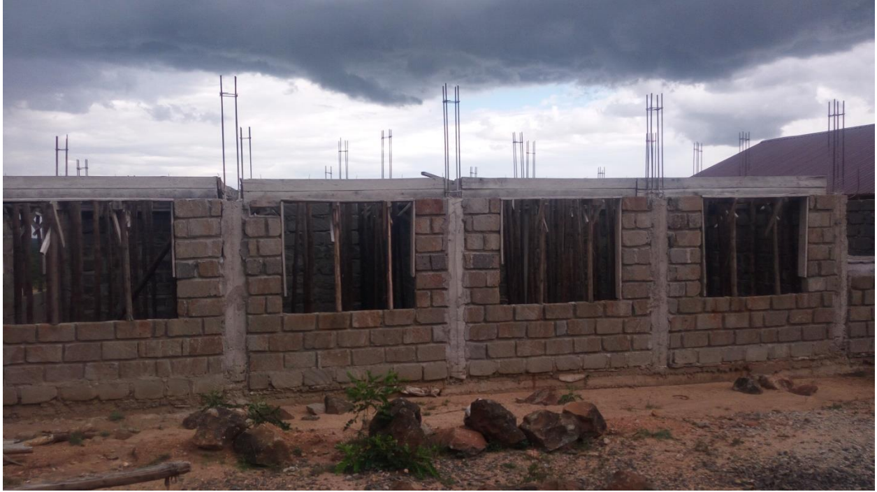
Figure 2: Kanyerus administration block