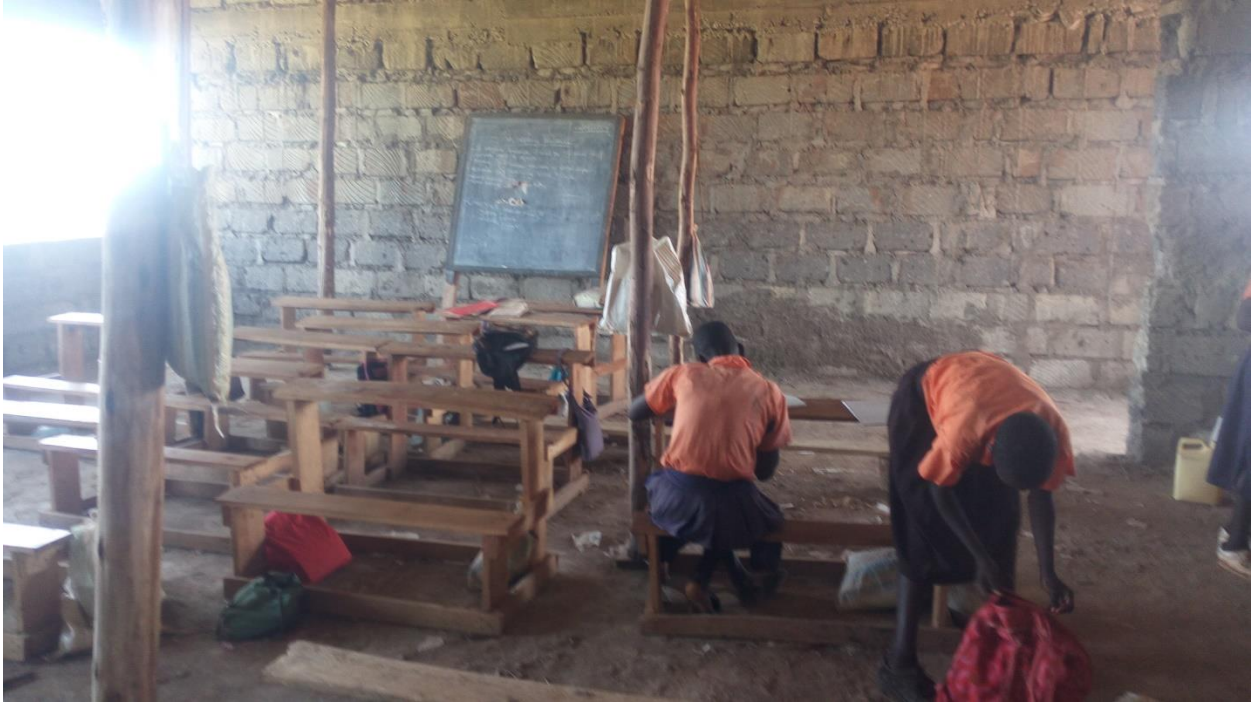
Table 4: Katikomor Grade 5 using building under construction