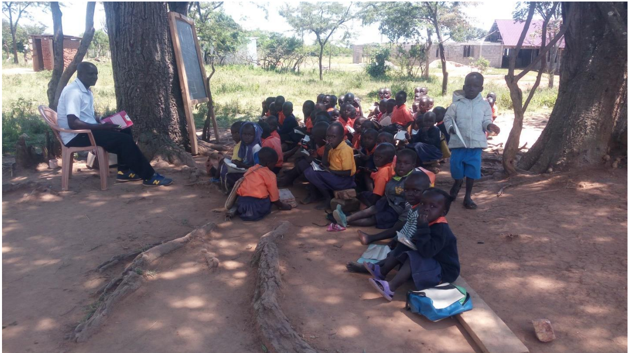
Figure 10: Katikomor PP1 class learning under a tree