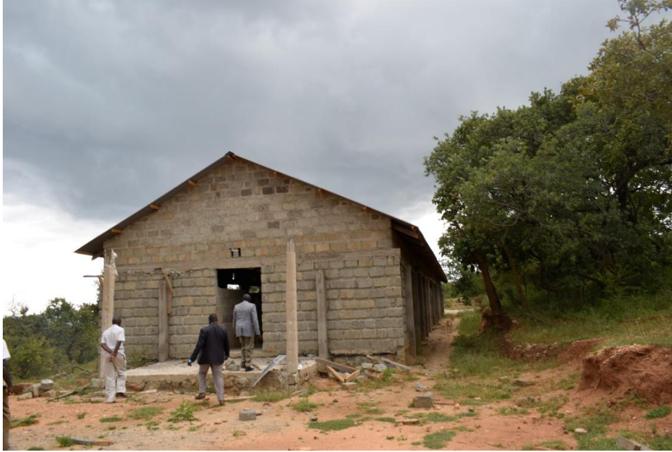
Figure 3: Kanyerus dormitory –roofed