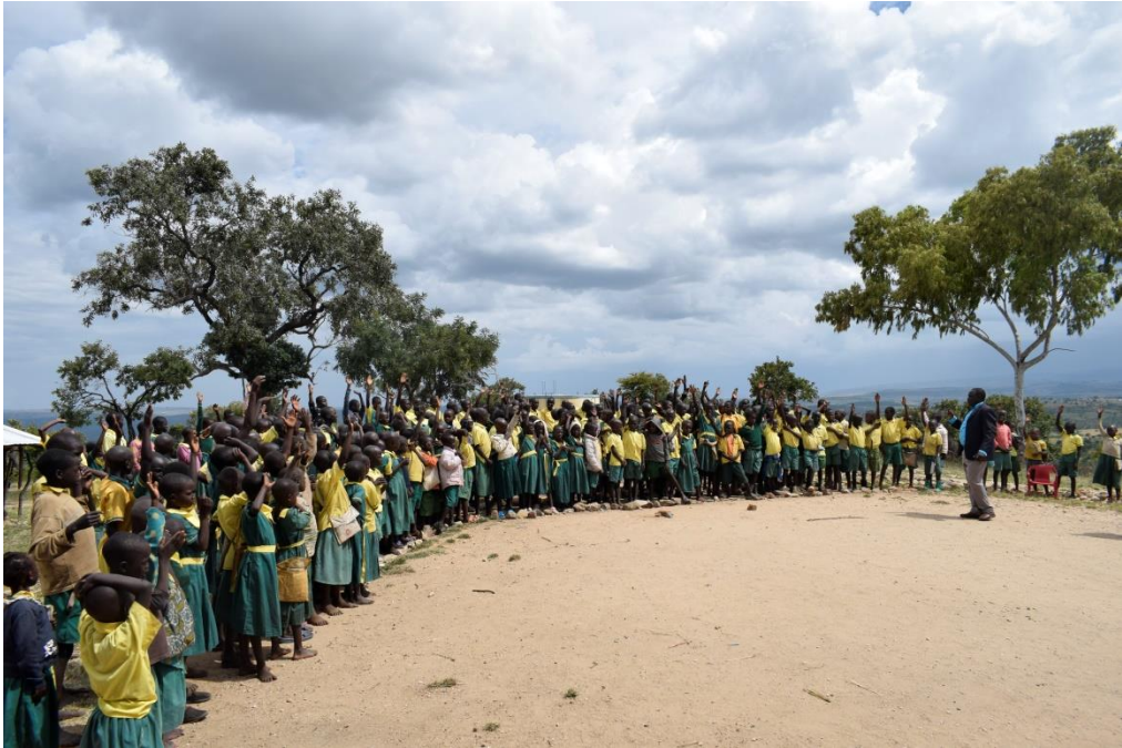
Figure 6: Kanyerus pupils from Uganda