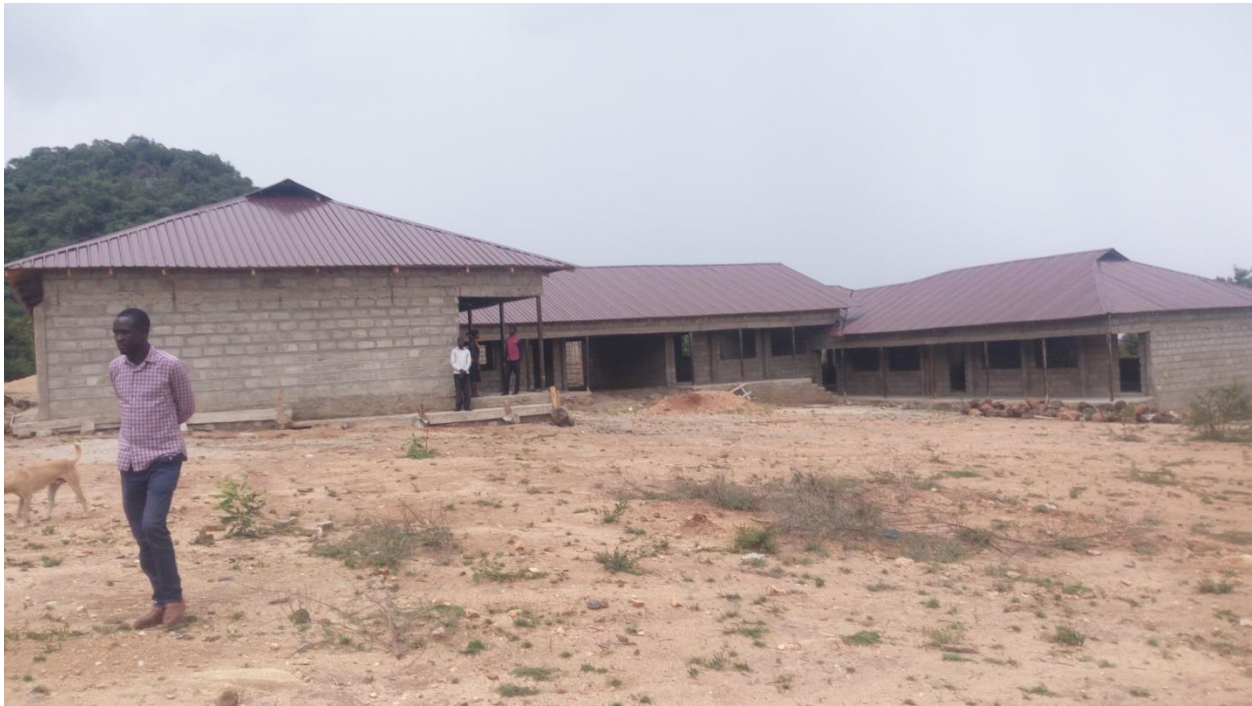
Figure 1:Kanyerus classroom block