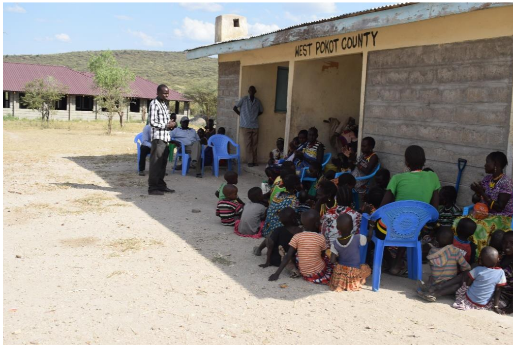
Figure 16: Community engagement with Akulo residents

During the fieldwork, the communities were engaged to give their inputs on the on-going construction of peace border schools, they were happy for the projects and they requested for early completion of the peace school for their children to have good structures for learning. They were willing also to enroll for adult education classes during afternoon.