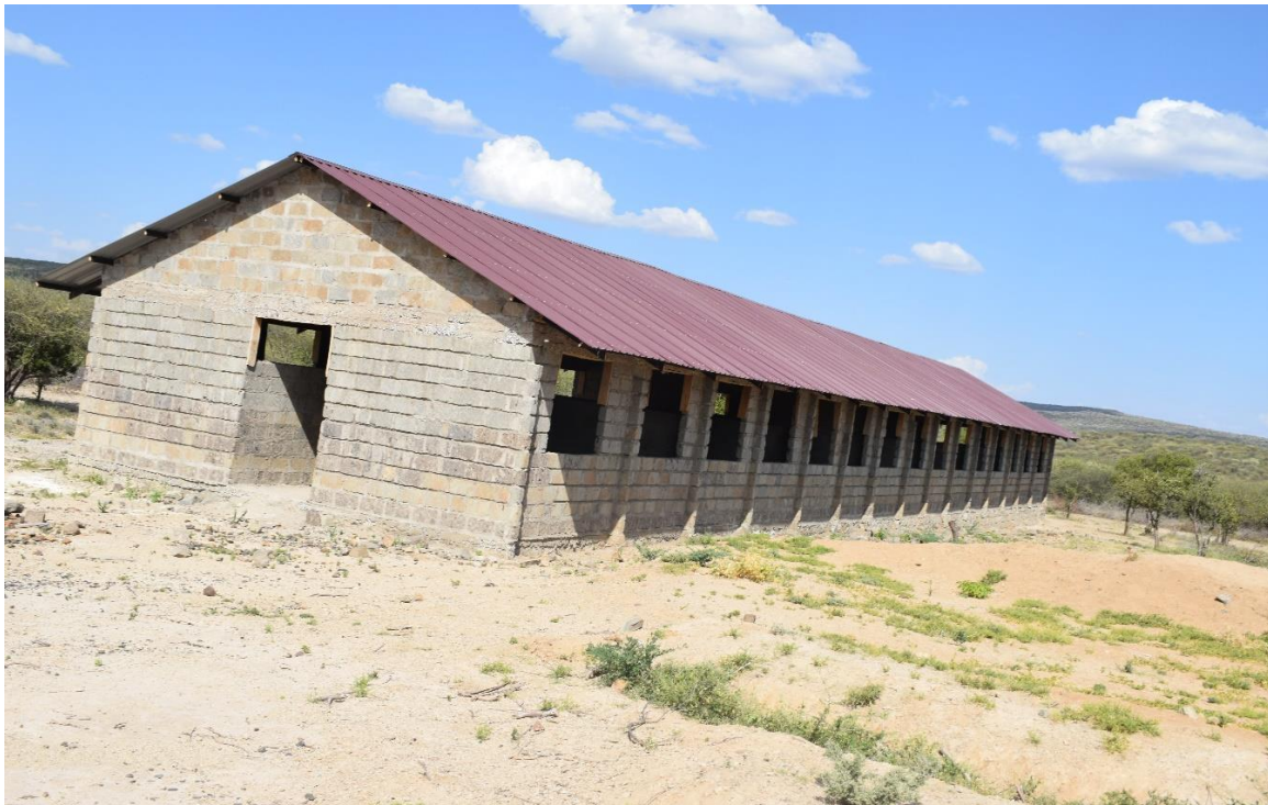
Figure 11: dormitory at Akulo peace school