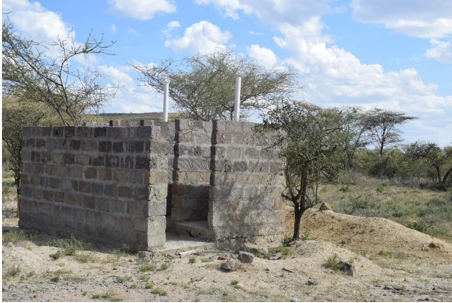
Figure 13: pit latrine constructed at Akulo peace school