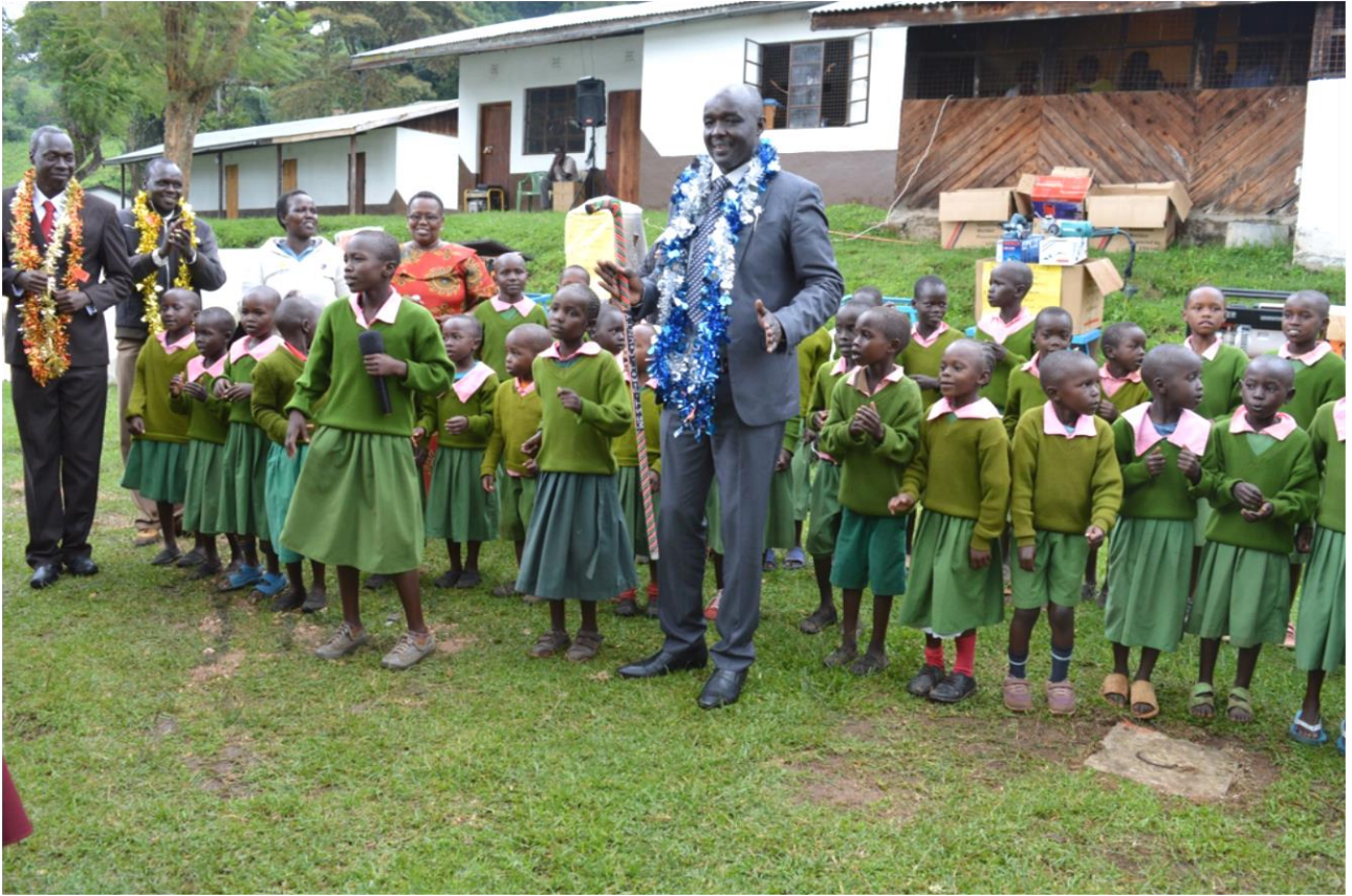
Figure 1: Official opening of ECD Colledge