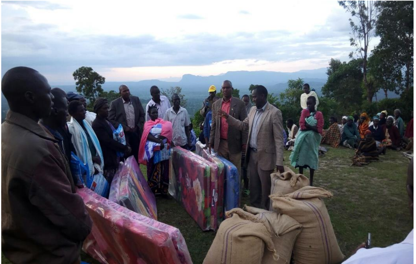
Figure 9: H.E Deputy Governor responding to landslides emergency at Chepareria