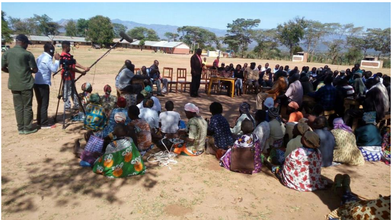
Figure 2: Public participation forum at Cheparerria Ward

During 2015/16 FY, the department conducted Public participation process involving community in 168 sub- locations across the county to identify priority projects.