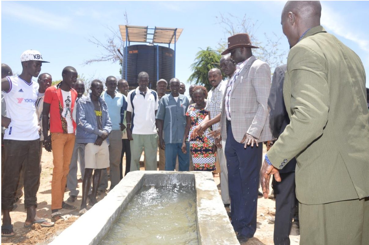
Figure 8: Governor Simon Kachapin inspecting Water project at Chepkram in Riwo ward

The department is made of water and land reclamation department. The department is mandated to promote access to clean and safe water and Implement appropriate land rehabilitation and reclamation projects to improve land use and productivity.