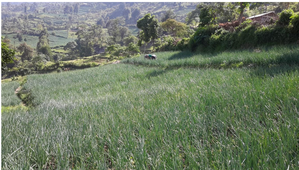
Figure 6: Onion farming through Mokuwo irrigation scheme in Batei Ward

The department of agriculture is mandated with crop production for food security and income generation. The county greatly relies on agriculture for wealth creation and poverty eradication. The department focuses on creating an enabling environment for farming and providing extension support services to farmers.