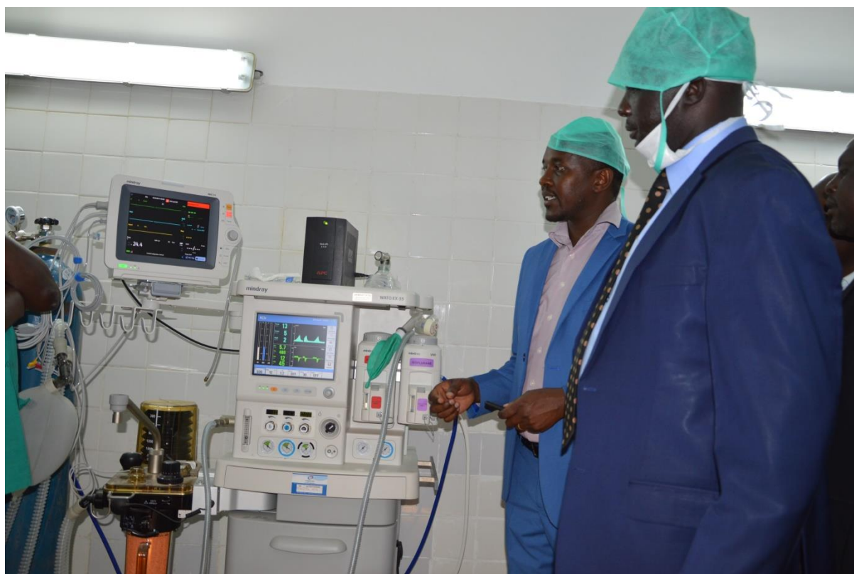
Figure 4: Opening of Kapenguria theatre after Rennovation

Departments are made of curative and preventive services units.