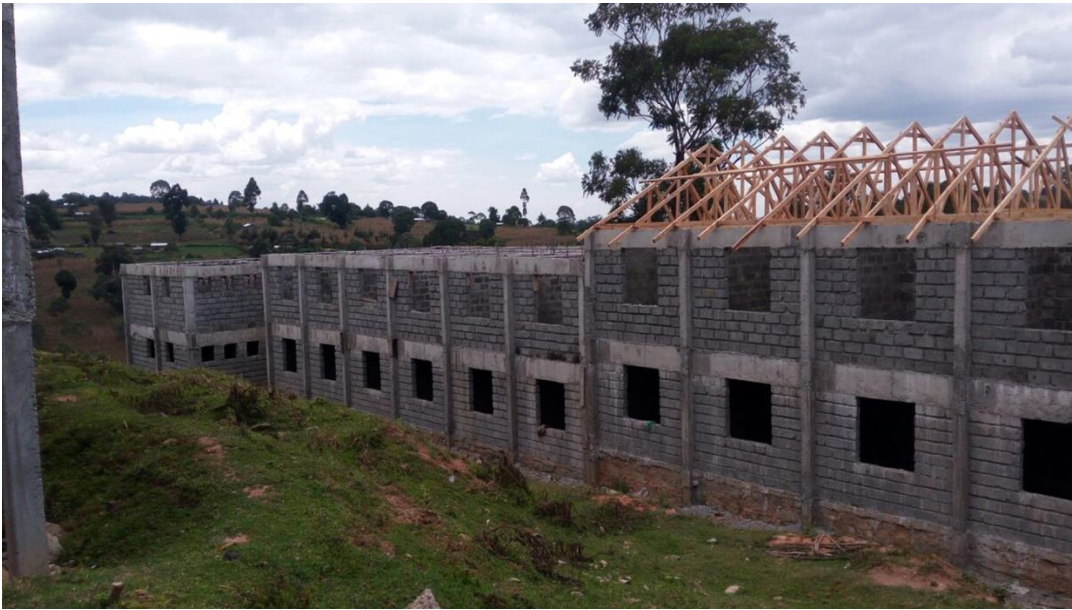
Figure 5: Construction of ECD College Hostels at Kapenguria

The ministry has three departments: ICT, youth training, ECDE and ECD College;