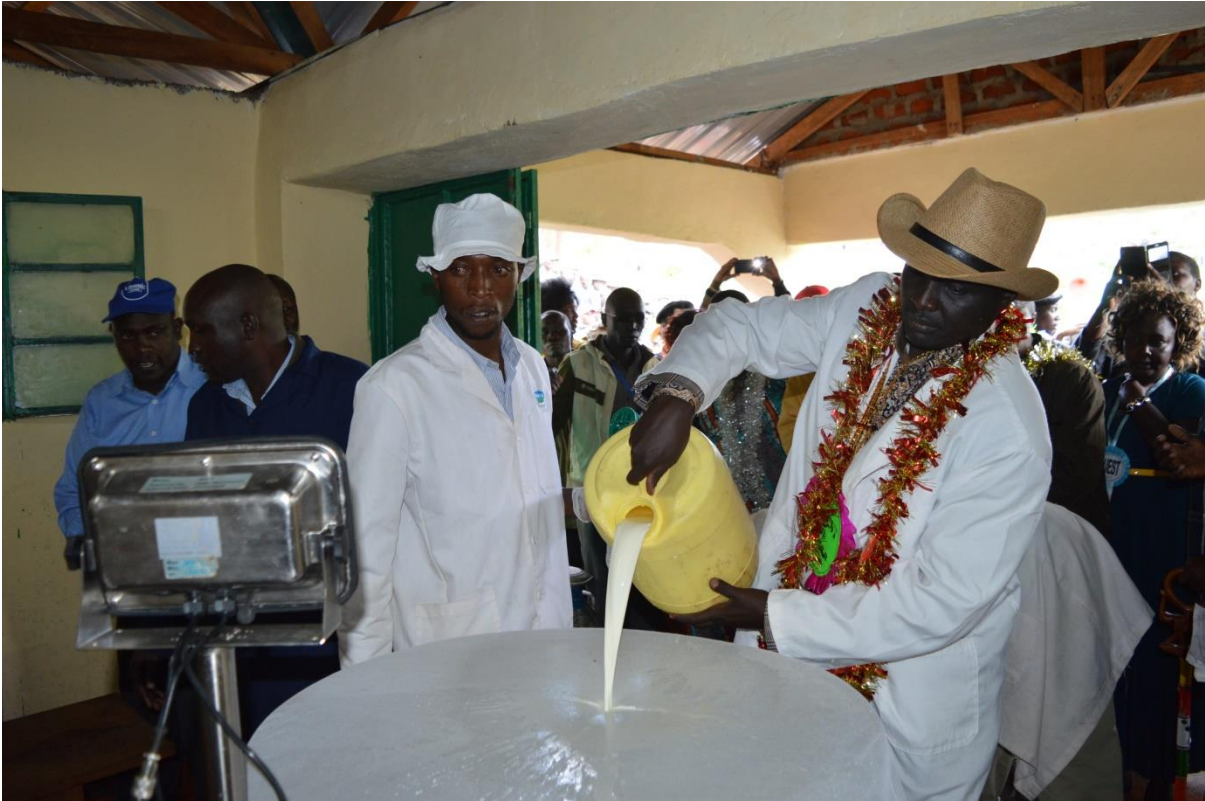
Figure 7: H.E. The Governor opening Ring Ring cooler

The ministry consists of the following departments: trade, weight and measurements and cooperatives