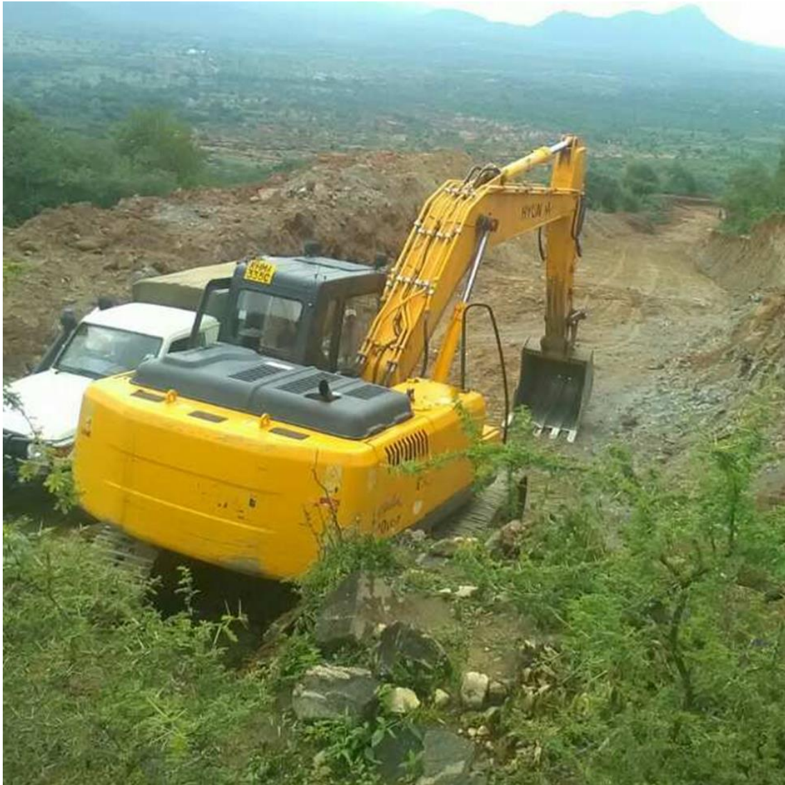
Figure 3: Kreswo-Atacha Road in Riwo ward under expansion

The ministry consists of three departments; roads, public works and transport with key mandate of maintenance of roads and bridges, transport safety, design and supervision of county public works to facilitate sustainable socio-economic growth and development.