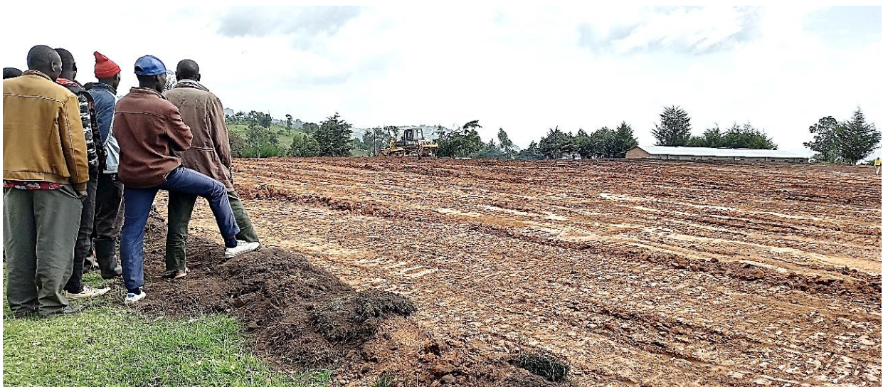
Figure 7: Kapkunyuk Primary playing Field levelling

The mandate of the subsector is to carry out formulation, coordination, administration of policy and programs with respect to promotion of Tourism, Culture, Sports, Youth, Social and Children Services functions. The department has the responsibility to provide an enabling environment for all stakeholders in the sector. The sub sector composition includes Tourism, Culture, Youth, Gender, Sports and Social Services