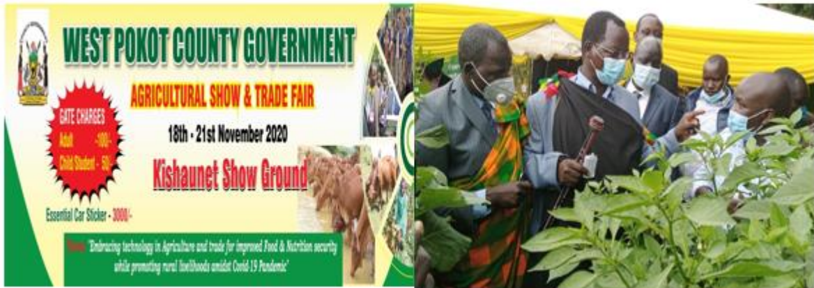
Figure 2 Kishaunet Agricultural show exhibition