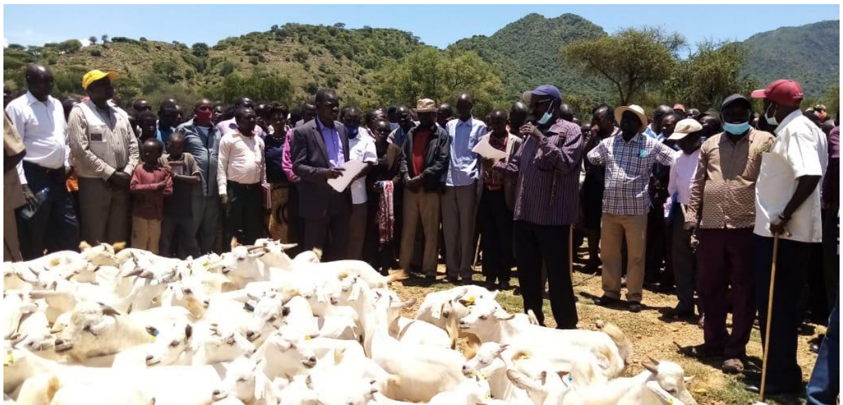
Figure 5: H.E Governor Lonyangapuo, launching Galla goat at lomut ward