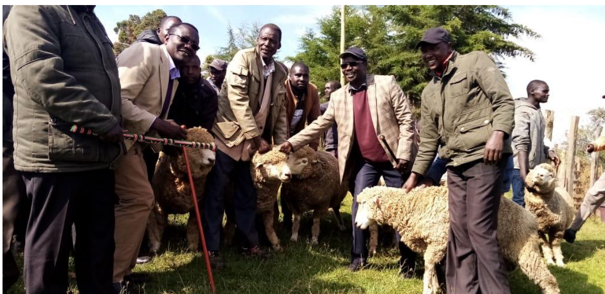
Figure 3: Distribution of Wool sheep at Tapach Ward