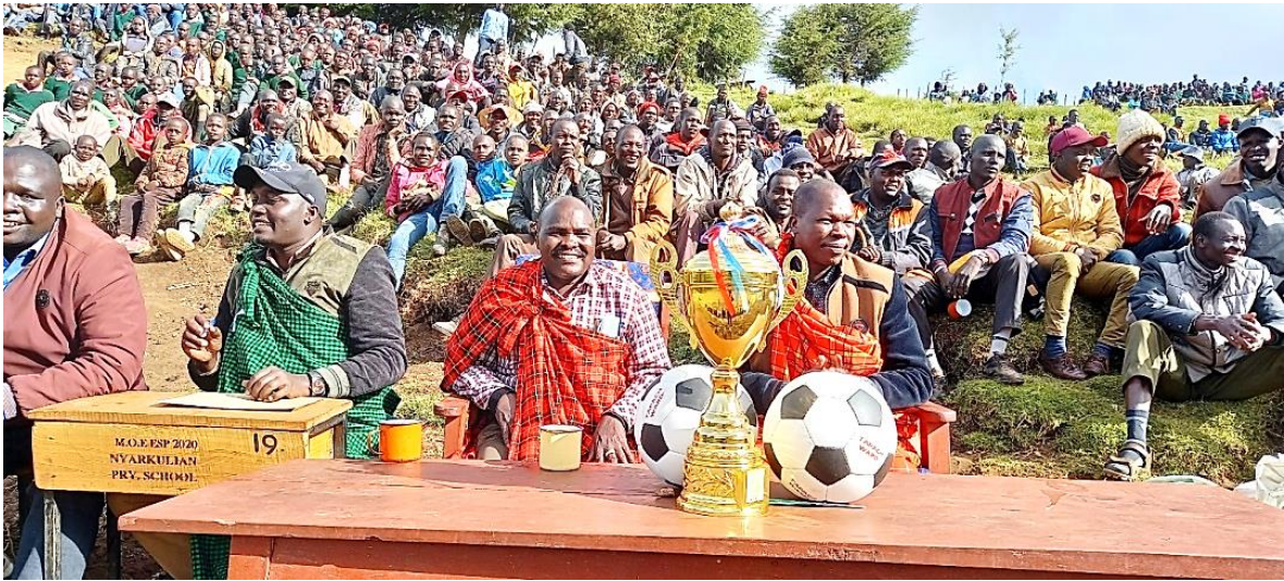
Figure 6: Tapach Ward Sports Tournament Finals