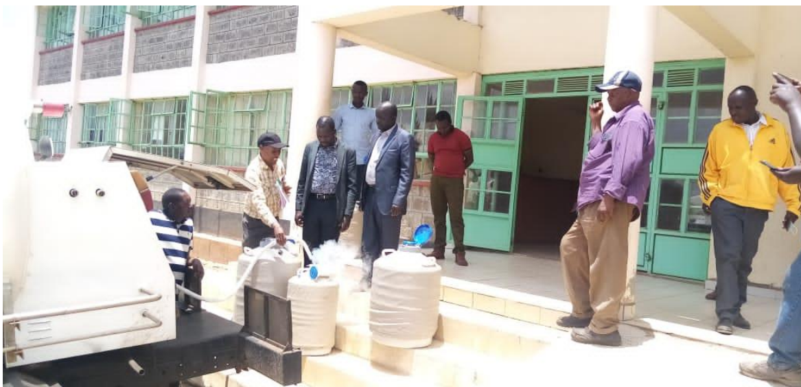
Figure 4: Receiving Artificial Insemination material from KAGRI